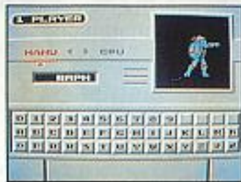
Character selection screen for the Tournament mode

☺ If you use human players, they will be able to enter a four letter/number name. Use the control pad to move to a letter/number on the keyboard screen. Press A to accept the selected letter/number. Move to